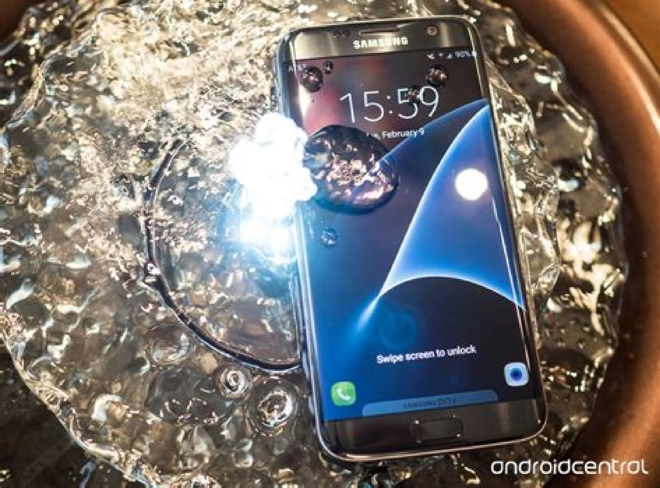
Does samsung galaxy s7 edge have waterproof. Is the samsung galaxy s7 edge waterproof.